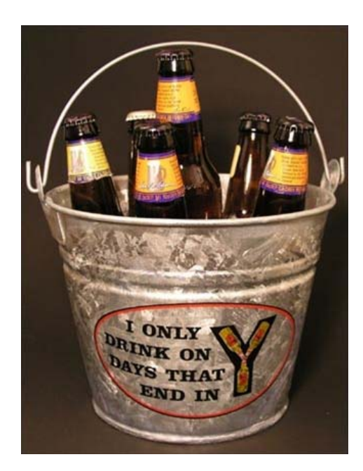
Buckets of Beer Domestic Beer ( 6 for $12.00) Heineken (6 for $18.00) Newcastle (6 for $18.00)

'01 Games (301, 501, 701, 901 & 1001) High Score Shanghai