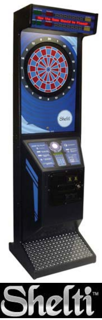
- - Two Units - -Model SD-A-E2-10