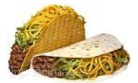
Hard Shell Tacos $1.00 Soft Shell Tacos $1.50 (Served on 6 inch shells with 2-1/2 ounces of meat)